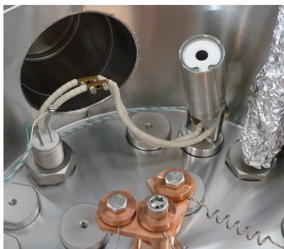
Above: LTE-1CC source fitted into Moorfield MiniLab 026 system.

A full range of feedthrough and thermocouple flanges and accessories (e.g., heat sinks, shielding, etc.) are available for customers wishing to retrofit the sources. Please contact us for details.